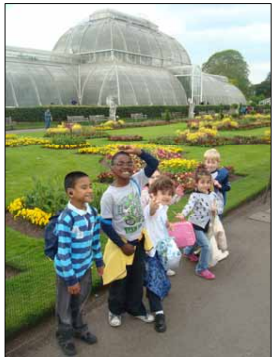
Children from Blanche Nevile at Kew Gardens

Template letters are available at: www.fairdealforharingeychildren.org